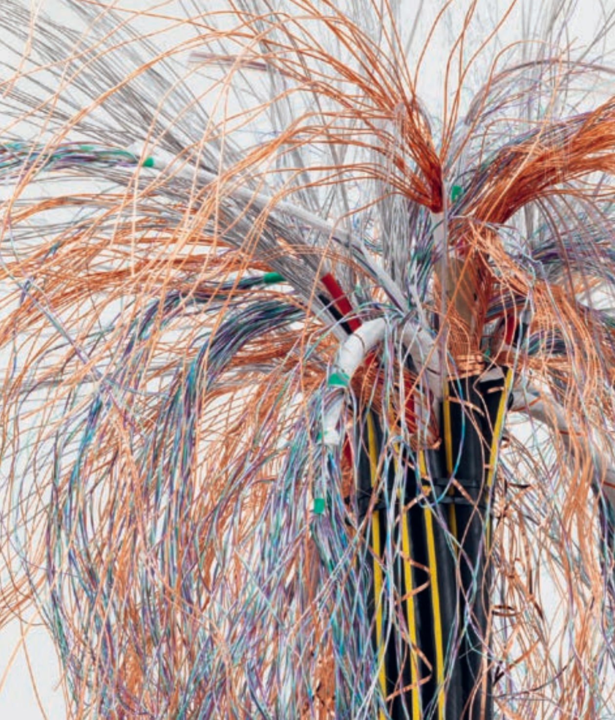
Vanesa Billy Large Burs II, 2019