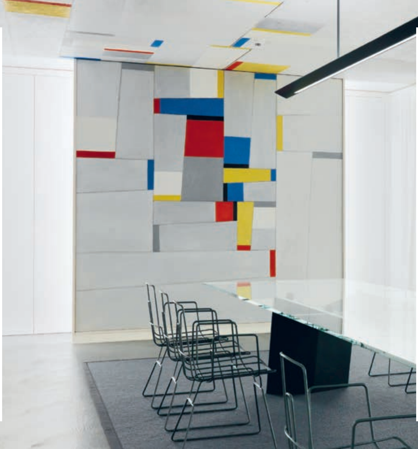
Fritz Glamer Rockereller Dining Room, 1963/1964

History that lives. Art that thinks ahead. The exhibitions at Haus Konstruktiv bring art-historical heritage into the present. Tradition meets innovation. Contemporary concepts are reflected in works from the past. Rethinking the old. Anchoring the new.